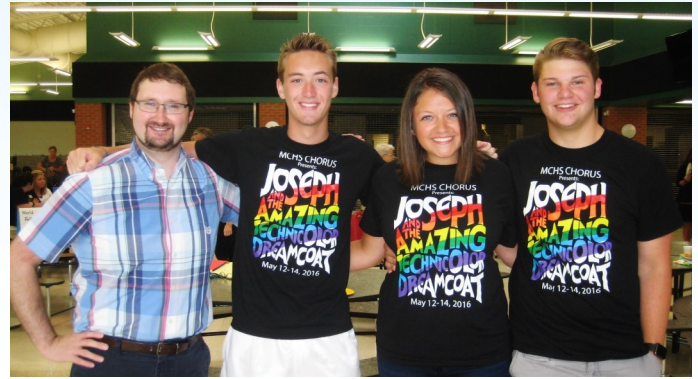
Entertainment for the luncheon by cast members of Joseph and the Amazing Technicolor Dreamcoat.