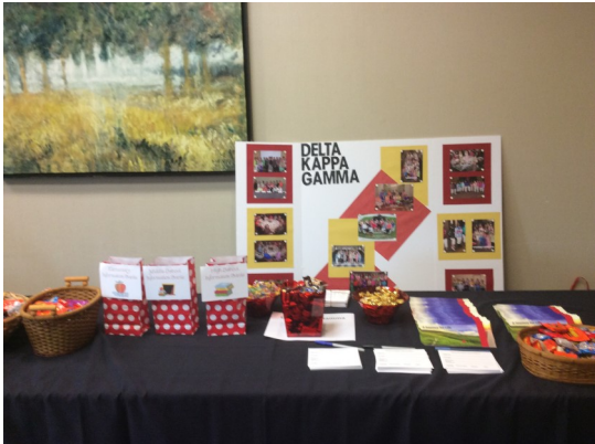
Louisville Chapters host an informative session at the new Teacher Institute in Louisville, KY.