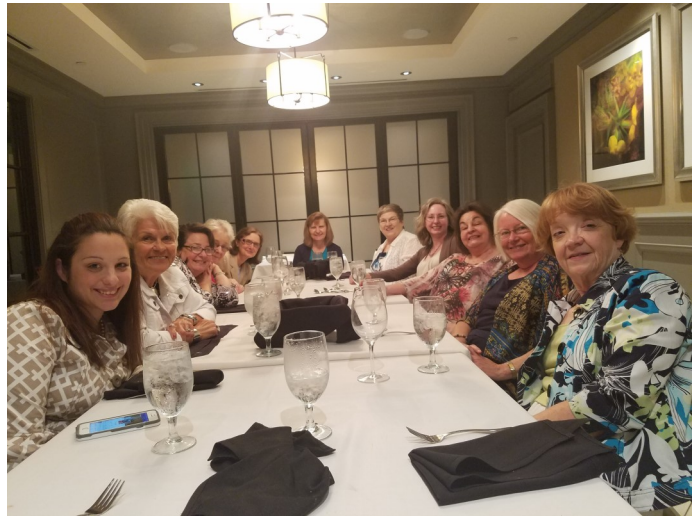
Right: Some of the KENTUCKY group gets together for a meal in Nashville.